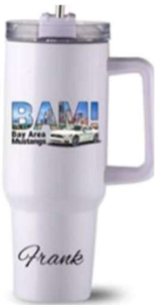
40 oz Tumbler