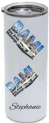
20 oz Tumbler