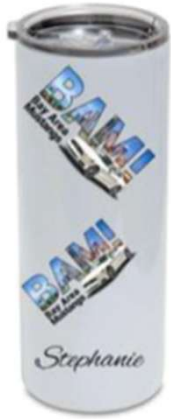
30 oz Tumbler