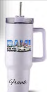
40 oz Tumbler