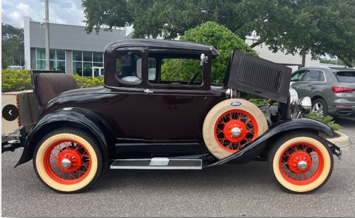
Sponsor's Choice Winner!

Mustang Madness Car Show, Saturday, October 21st, 2023 —Continued from previous page.