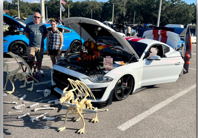
Best Dressed Car Winner!