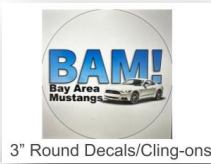
3" Round Decals/Cling-ons