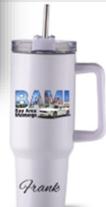
40 oz Tumbler