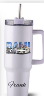
40 oz Tumbler