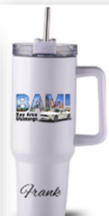
40 oz Tumbler