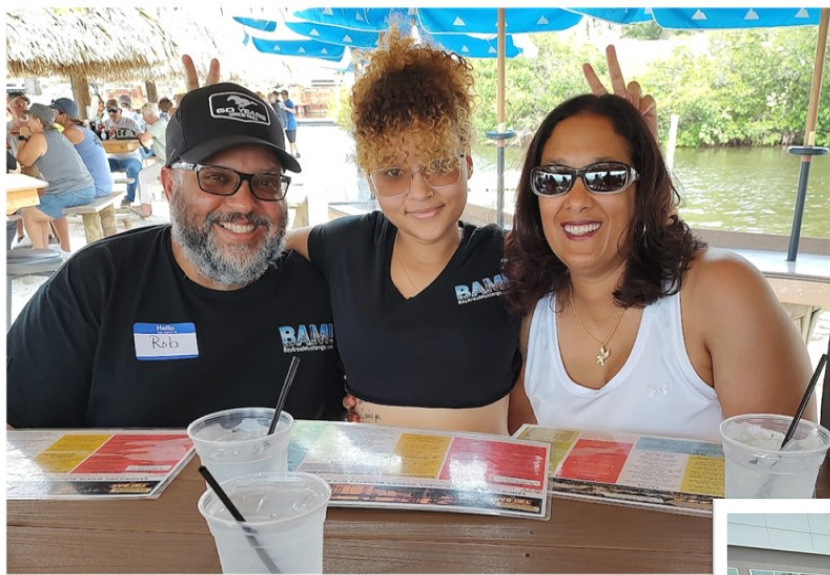
(Top Picture Left)