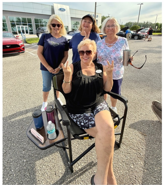
(Bottom Picture Left)